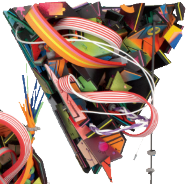
"Nom, Nom, Nom" (2011; EVA foam, foamcore, chipboard, glue, paint marker and spray paint 12"x24"x36") "A lot of my pieces are about holding things together, finding the moment just before something is about to fall apart."

Hangin' out with New York-based sculptor Ben Bunch's latest work gave me a flashback to that episode of Captain N: The Game Master where the gang travels to Tetris Land, and the flat, staid puzzle game is transformed into a city full of block people and impossible skyscrapers. Similarly (but, obviously, with far more subtlety and grace), Bunch's sculptures humanize computers, machines and the lovely, complex things that lie within them. Arcade games, printers and turntables are re-created out of brightly colored foam and paper, and then glued together by a wily and precise craftsman. Some machines are allowed to remain intact and keep their dignity, while others are opened, piles of lewd innards spilling out in exuberant coils. Other pieces are comprised of variegated computer guts alone, combined and reconfigured into primeval shapes. Bunch's main medium is meticulously carved, light, flat